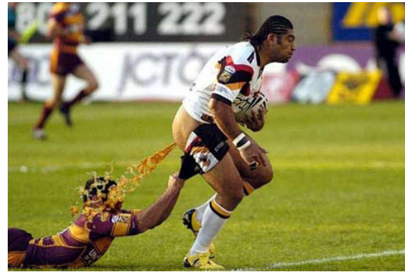
Talk about getting Shit-Faced. Ugh!

In baseball, Team Rocket spokesman Roger Clemens